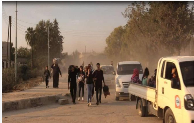
People of Sari Kaneyh (Ras al-Ein) have been displaced from their homes

It is worth mentioning that the convoy was accompanied by several journalists from the media and by the protection of members of the (internal security forces "Asayish"), where they were targeted directly and brutally reflects what the Turkish regime really plans and reveals its intentions the real thing that is the extermination of the Kurdish people, to continue the project of change the demography of the areas.